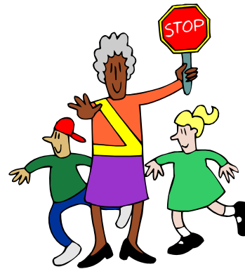
The speed limit in the Sedley school zone is 30 KMH.

It's time we stop talking and take a stand and say NOT in our community!