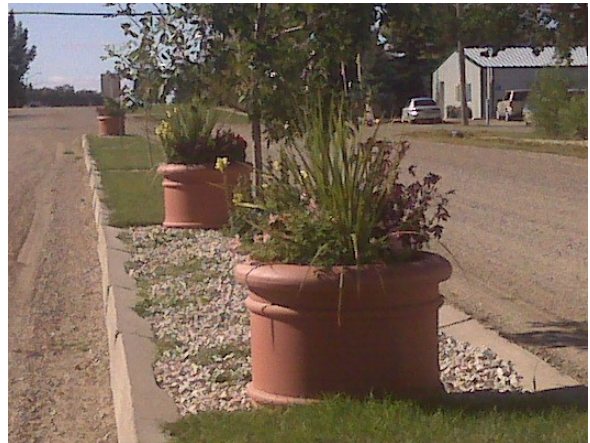
A view of the new planters on Broadway Street

In addition to improving green spaces this Committee provides a forum for the youth in our community to work with seniors to learn new skills and foster a sense of community involvement.