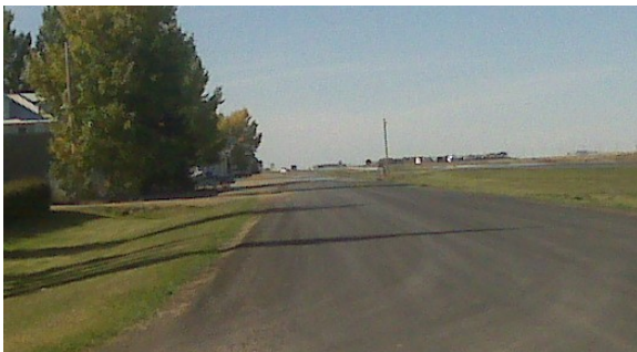
Sedley Service Road upgraded July 2009

Over the last few years Village Council had been requesting Saskatchewan Highways perform repairs on the Sedley Service Road.